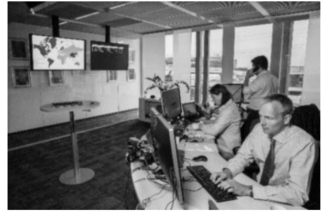
Medical and security assistance